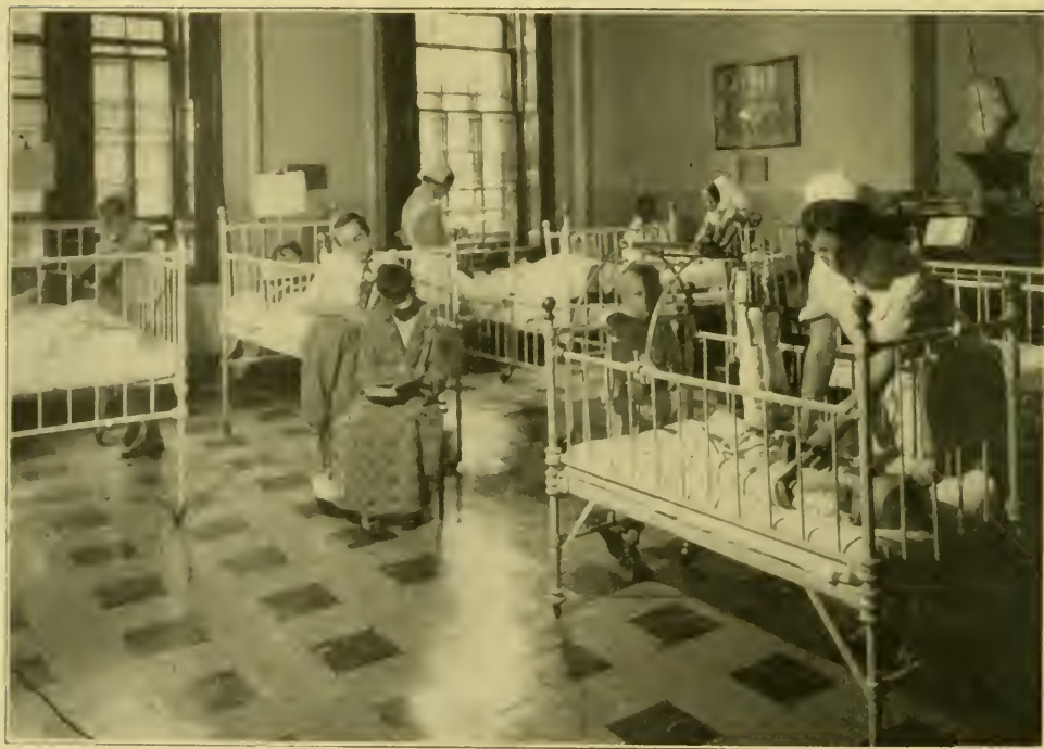
Surgical Ward in Children's Hospital of the Philadelphia Motherhouse